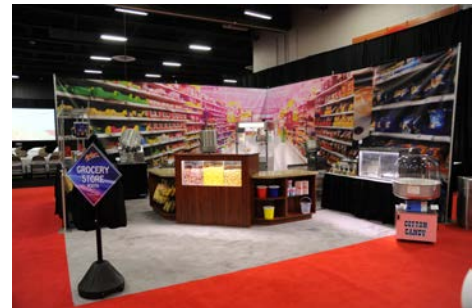
The new booth set-up was engaging and served as a showcase for our products.