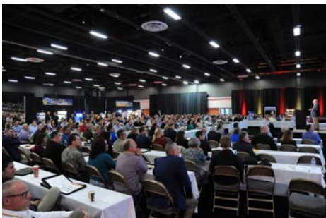
The crowd learned about the 2017 new product line-up and more with in-depth presentations.