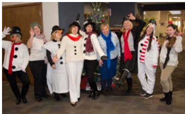
Holiday Fun, in Community Corner