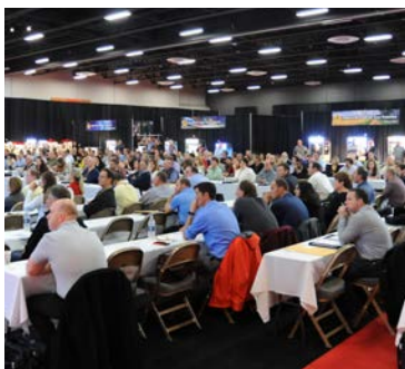
2016 Dealer Meeting, in Community Corner