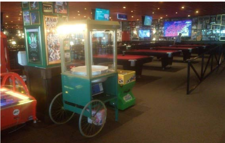
At O’Leary’s in Belgium, they are seeing green with these poppers displayed on custom green-painted antique carts. Nice job Tom Rose (International Dept.)!